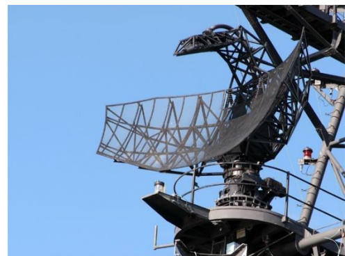
SPS 40 Anti-Aircraft Radar Antenna

Several weeks before the ship’s final inspection to clear us to leave the yard, the ship’s main anti-aircraft radar (SPS-40) went down. This is no trivial matter – it was our main defense for our Sea Sparrow missiles against air and missile attack in combat. The SPS-40, being a vacuum tube design, was notoriously sensitive to the vibration from shipboard gunfire.