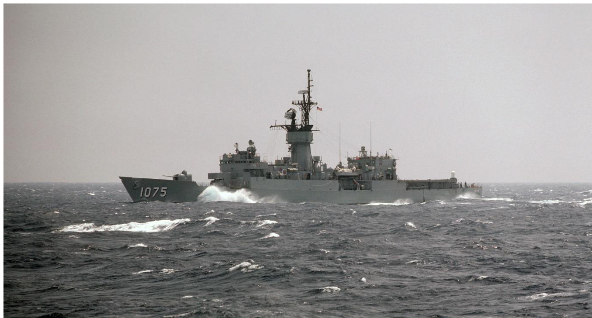
USS Trippe at sea in the North Atlantic in a light chop