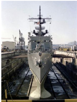
USS Voge -- the Unwitting Sacrificial Lamb